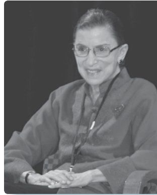
Justice Ruth Bader Ginsburg

The opening plenary session of the joint conference featured a dialogue between Justice Ruth Bader Ginsburg