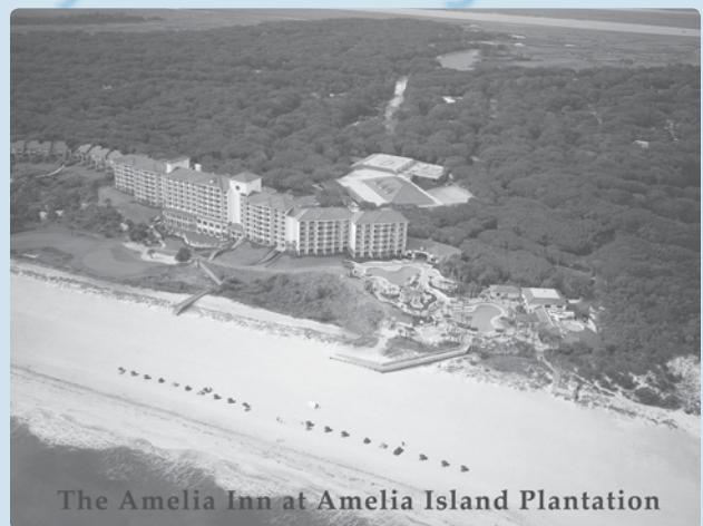
The Amelia Inn at Amelia Island Plantation