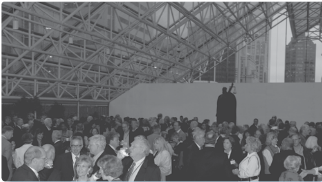
AJA, CAPCJ, and BCPCJA members enjoy a reception at the Supreme Court of Canada.

of the Supreme Court of the United States and Justice Ian Binnie of the Supreme Court of Canada, with Justice Lynn Smith of the Supreme Court of British Columbia acting as moderator. Topics included judicial independence and impartiality.