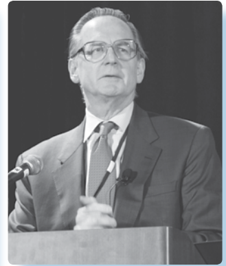
Justice Ian Binnie